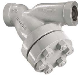
Bolted Cover (Sizes 1-1/4" to 2")

Model 1500YTS (Threaded) – Cbn. Steel Model 1500YSWS (Socket Weld) – Cbn. Steel Model 1500YTSS (Threaded) – Stn. Steel Model 1500YSWSS (Socket Weld) – Stn. Steel