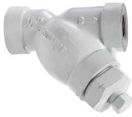
Threaded Cover (Sizes 1/2" to 1")