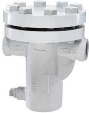
Model 300BTSB (Threaded) – Carbon Steel Model 300BSWSB (Socket Weld) – Carbon Steel Model 300BTSSB (Threaded) – Stainless Steel Model B300BSWSSB (Socket Weld) – Stainless Steel