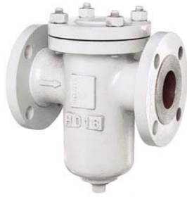
Model 150BFSB1 – Carbon Steel