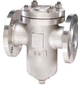
Model 150BFSSB1 – Stainless Steel