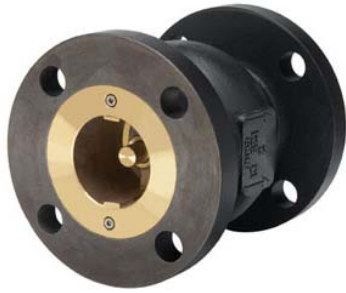
Model 125FCSIBM – Bronze Disc Model 125FCSISM – Stainless Steel Disc