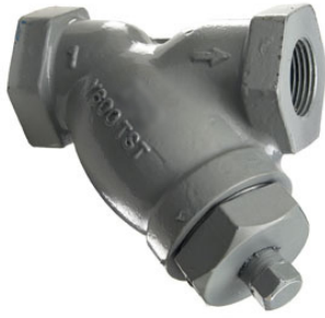
Model 600YTS (Threaded) – Carbon Steel Model 600YSWS (Socket Weld) – Carbon Steel