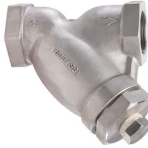
Model 600YTSS (Threaded) – Stainless Steel Model 600YSWS (Socket Weld) – Stainless Steel