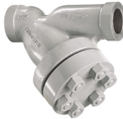
Bolted Cover (Sizes 1-1/4" to 2")